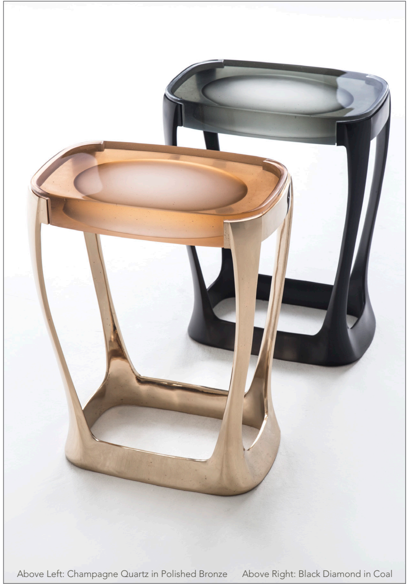
Above Left: Champagne Quartz in Polished Bronze Above Right: Black Diamond in Coal